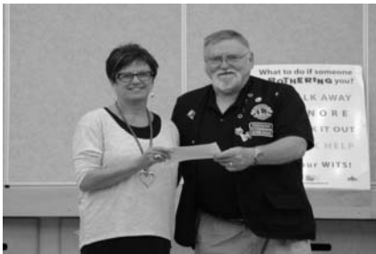
Picture of the presentation of a cheque from the Annapolis Royal Lions Club to the Natural Playground Construction Committee in Granville Ferry at Champlain Elementary School

The Annapolis Royal Lions Club wish to thank the residents of Annapolis Royal and surrounding area for their support during the lionistic year just completed. The lions have broken down their activities into four areas: hunger, sight, environmental, and children/youth. In the past year, over 26 activities were carried out including transporting blood samples, fundraising with the Annapolis Valley Lions, funding the creation of hygiene/emergency kits for the homeless, sponsoring the Lions Peace Poster and Drug Awareness Poster Contests, sponsoring the school DARE Project, donating to fire victims, donating milk for the school lunch program, selling 911 signs, donating to Christmas Daddies and IWK Children's Telethon to name a few.