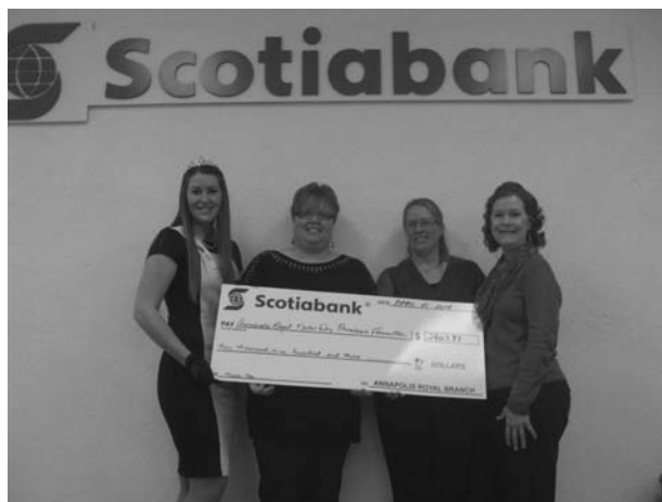
A photo of the Scotiabank Bright Future Cheque Presentation