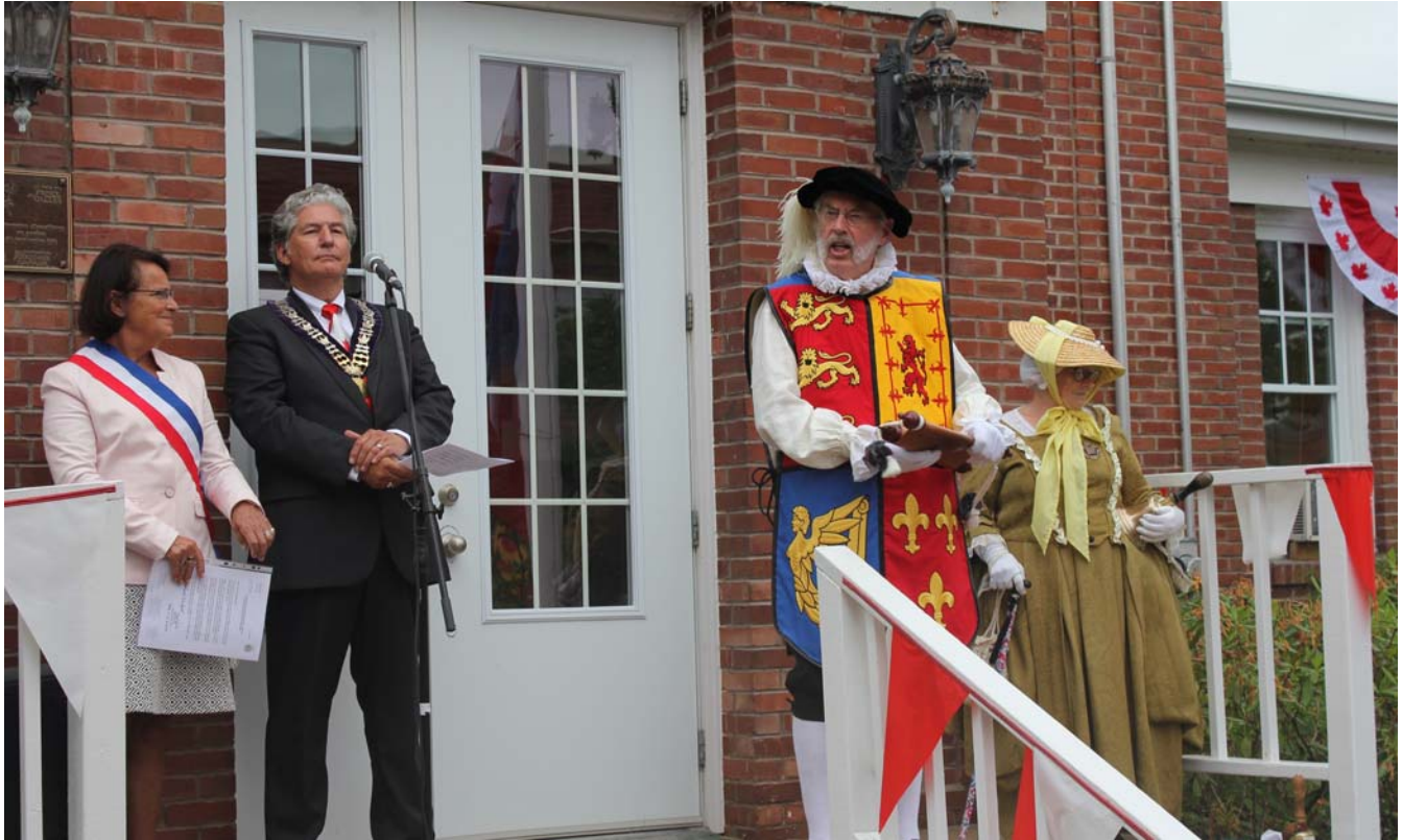
Send your photos to admin@annapolisroyal.com for a chance to be featured!

MONTHLY ANNOUNCEMENTS FOR RESIDENTS AND VISITORS OF ANNAPOLIS ROYAL AND AREA ANNAPOLISROYAL.COM