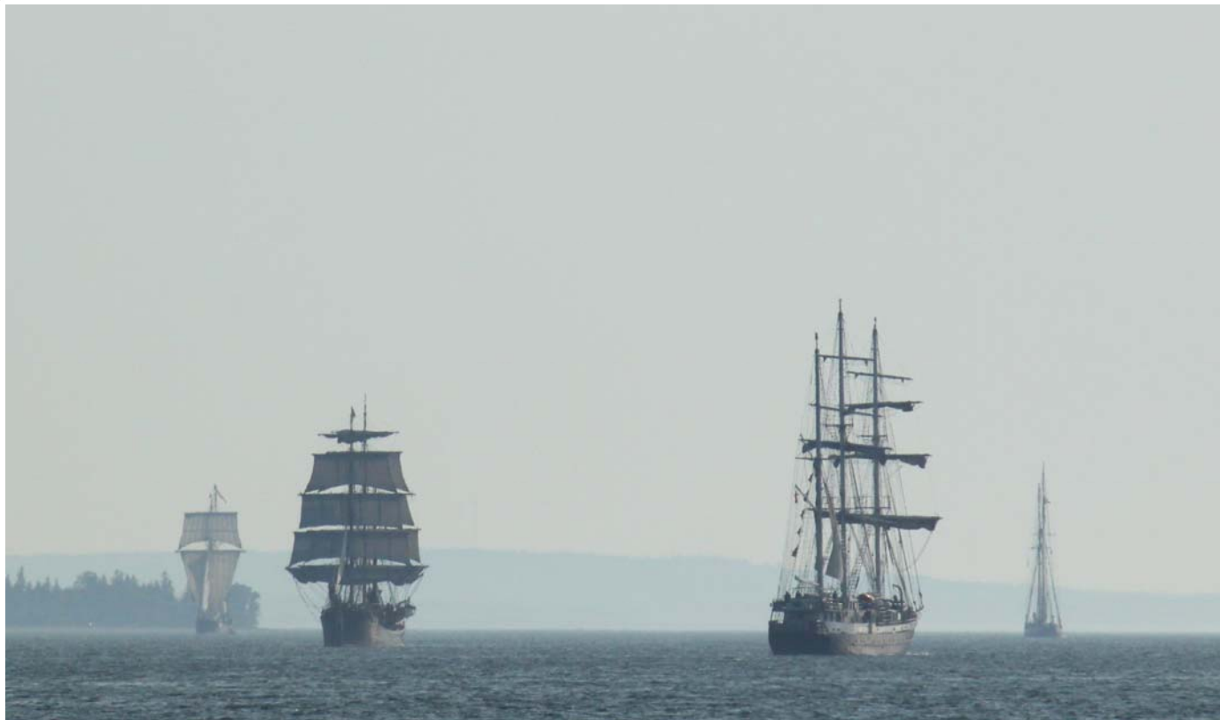
Send your photos to admin@annapolisroyal.com for a chance to be featured!

MONTHLY ANNOUNCEMENTS FOR RESIDENTS AND VISITORS OF ANNAPOLIS ROYAL AND AREA ANNAPOLISROYAL.COM