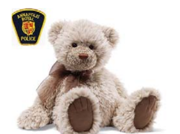
Annapolis Royal Police Department

A HUGE THANK YOU to everyone who graciously and