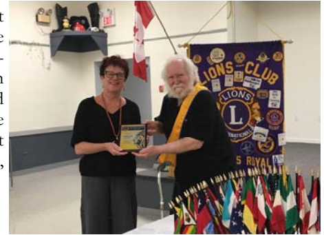
Annapolis Royal Lions Club Appreciation Night.