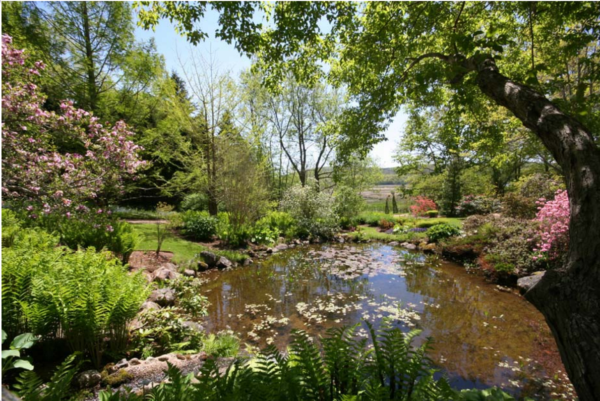
Send your photos to admin@annapolisroyal.com for a chance to be featured!