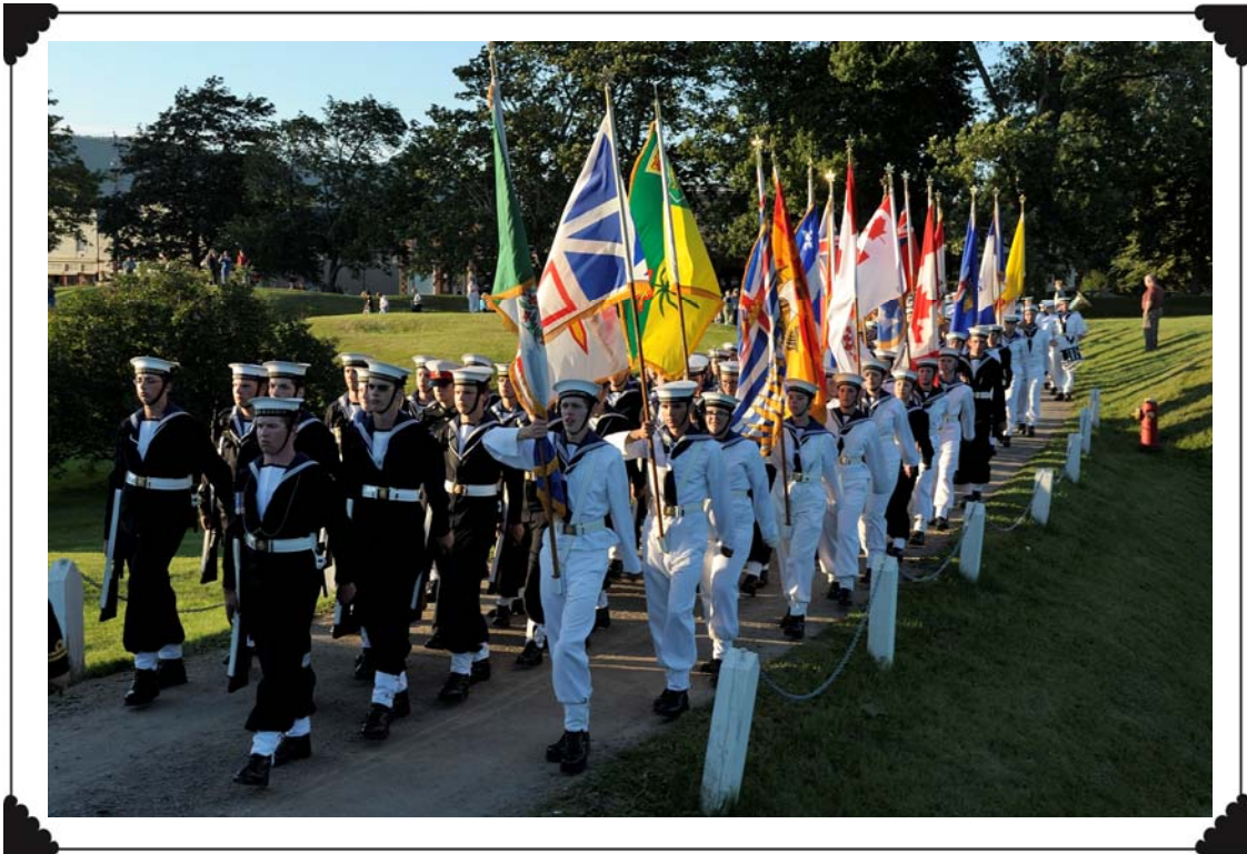
Cadets from HMCS Acadia Cadet Training Centre march into Fort Anne, Annapolis Royal, August 2013.

MONTHLY ANNOUNCEMENTS FOR RESIDENTS AND VISITORS OF ANNAPOLIS ROYAL AND AREA ANNAPOLISROYAL.COM