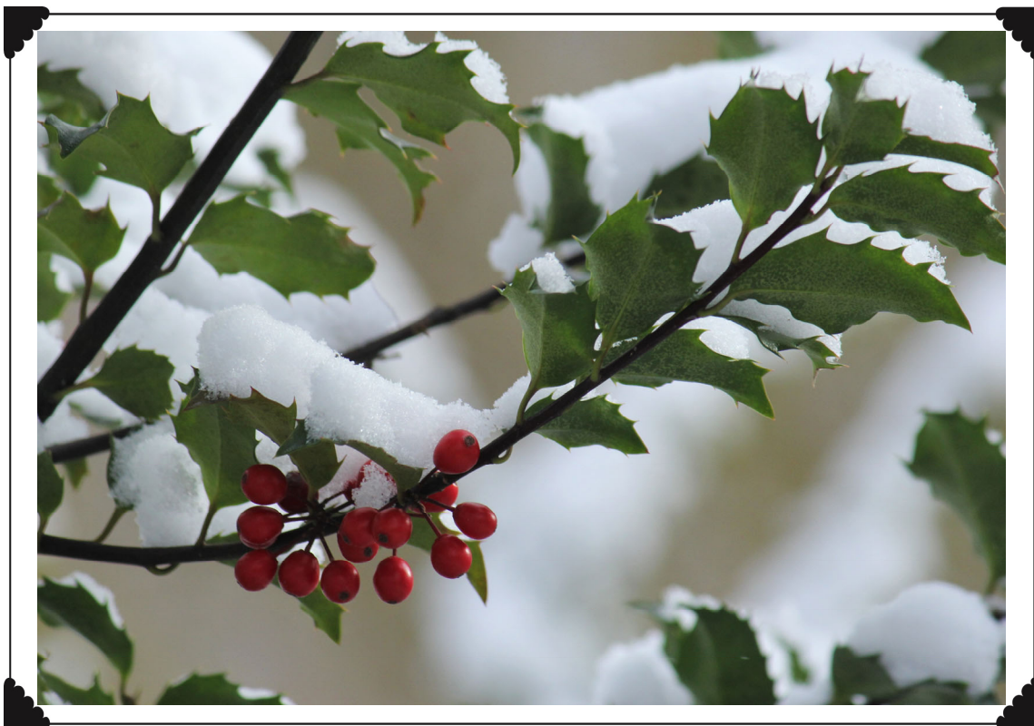
Send your photos to admin@annapolisroyal.com for a chance to be featured!

MONTHLY ANNOUNCEMENTS FOR RESIDENTS AND VISITORS OF ANNAPOLIS ROYAL AND AREA ANNAPOLISROYAL.COM