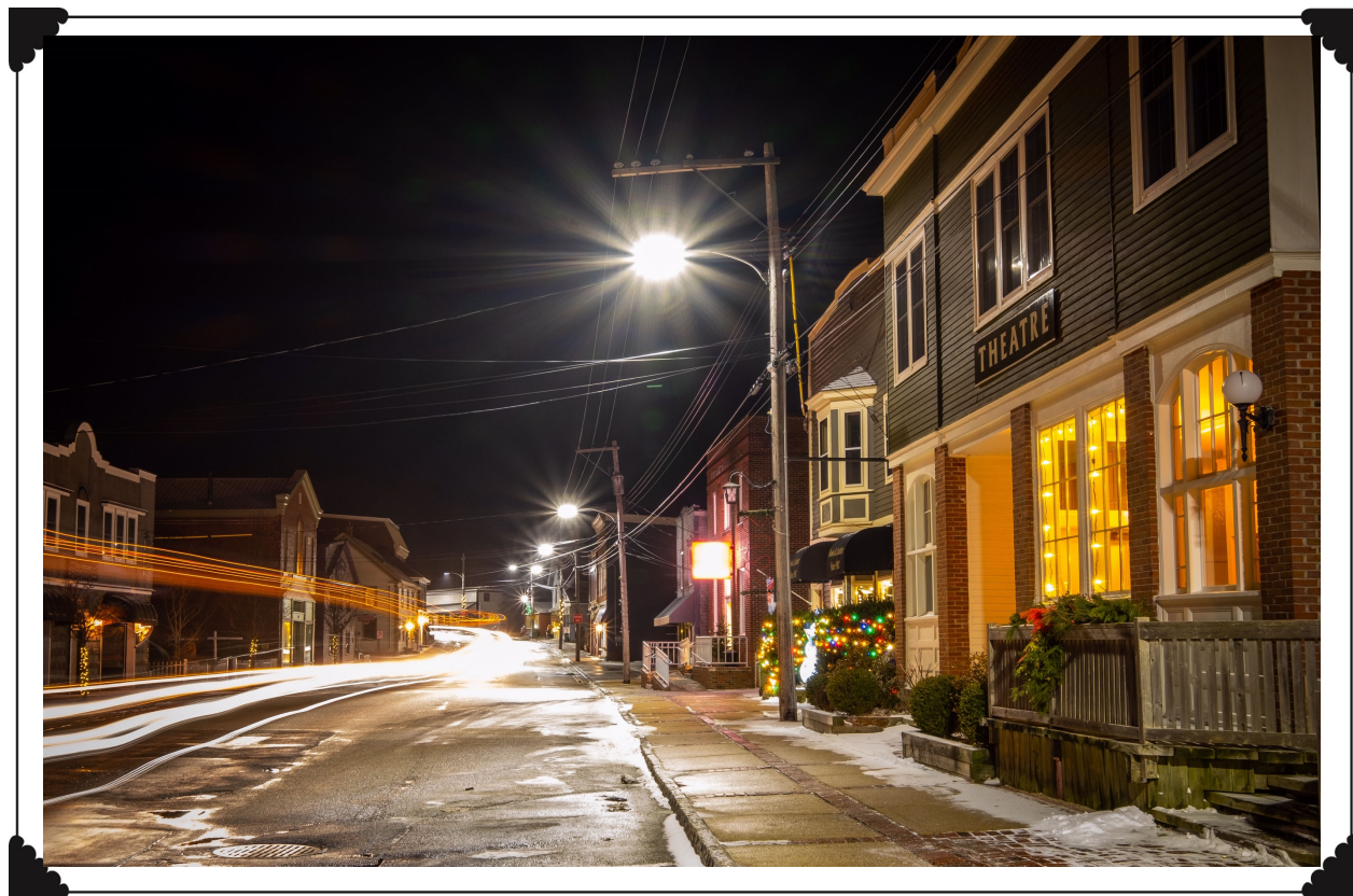
Send your photos to admin@annapolisroyal.com for a chance to be featured!

MONTHLY ANNOUNCEMENTS FOR RESIDENTS AND VISITORS OF ANNAPOLIS ROYAL AND AREA ANNAPOLISROYAL.COM