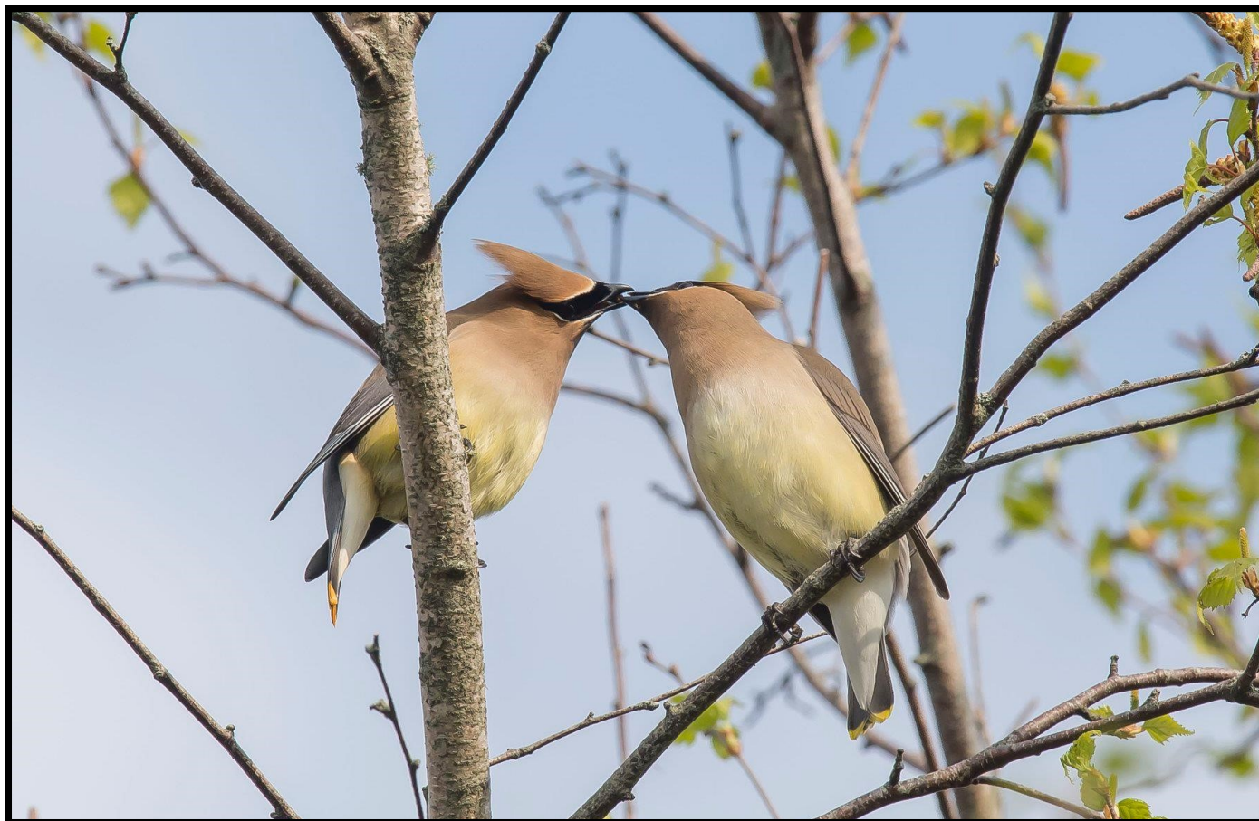
Cedar Wax Wings - French Basin Trail, Annapolis Royal. Send your photos to admin@annapolisroyal.com for a chance to be featured!

MONTHLY ANNOUNCEMENTS FOR RESIDENTS AND VISITORS OF ANNAPOLIS ROYAL AND AREA ANNAPOLISROYAL.COM