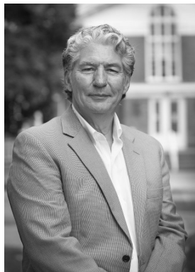
Mayor Bill MacDonald

Summer in the historic Town of Annapolis Royal. There's simply no better place to be! Whether you're looking to explore the early origins of our nation, participate in one or more of our annual festivals or cultural events, visit our many shops and galleries, or just leisurely stroll along our remarkable waterfront and streets lined with historic homes, Annapolis Royal promises a memorable experience for everyone.