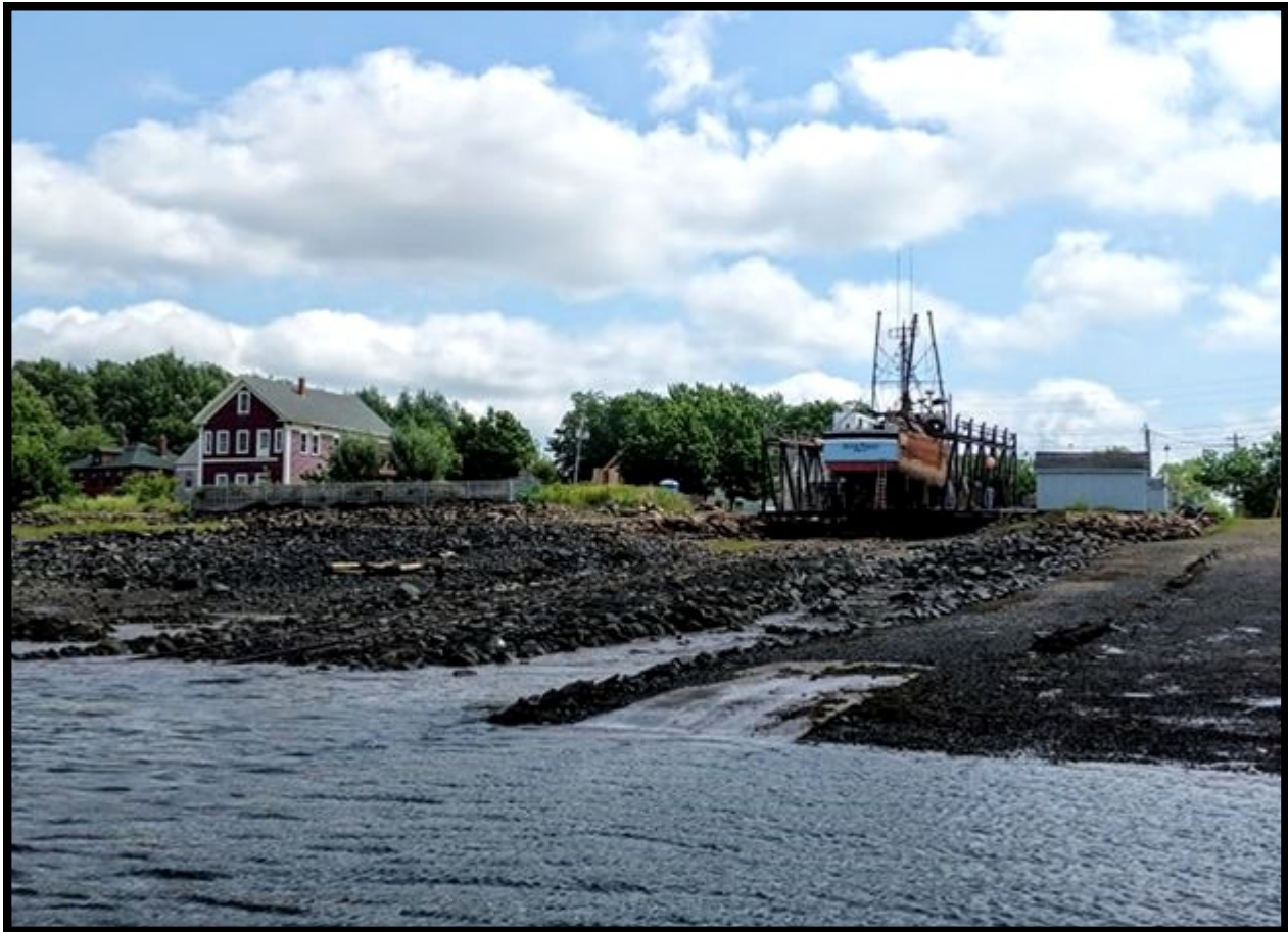
Send your photos to admin@annapolisroyal.com for a chance to be featured!

MONTHLY ANNOUNCEMENTS FOR RESIDENTS AND VISITORS OF ANNAPOLIS ROYAL AND AREA ANNAPOLISROYAL.COM