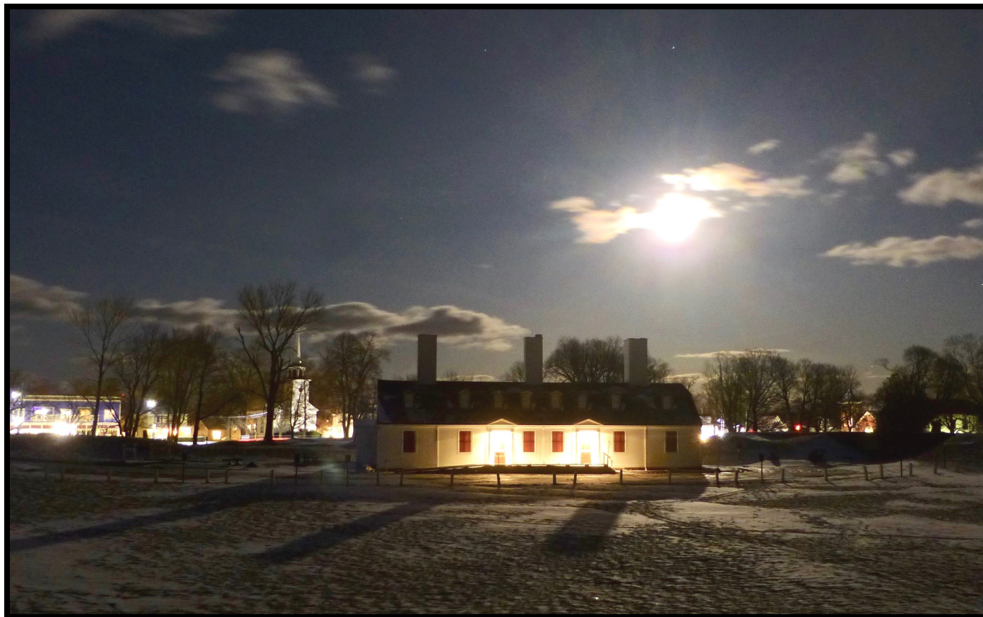
Send your photos to admin@annapolisroyal.com for a chance to be featured!