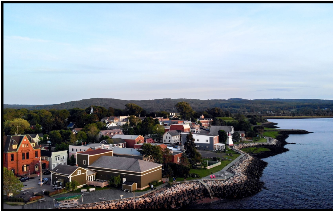
Send your photos to admin@annapolisroyal.com for a chance to be featured!

MONTHLY ANNOUNCEMENTS FOR RESIDENTS AND VISITORS OF ANNAPOLIS ROYAL AND AREA ANNAPOLISROYAL.COM