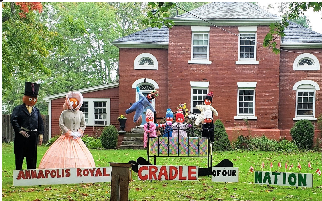
Send your photos to admin@annapolisroyal.com for a chance to be featured!