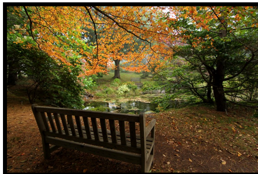
Both the Draconid Meteor Shower and the Orionid Meteor Shower occur in October.