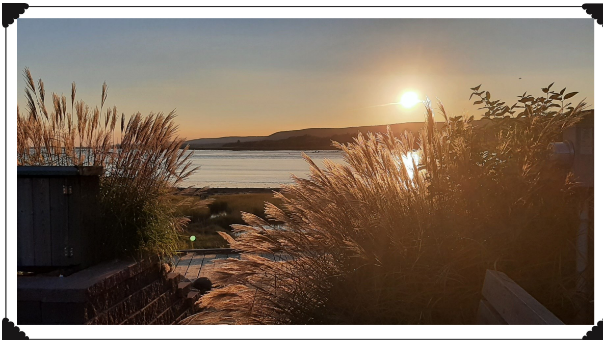
Send your photos to admin@annapolisroyal.com for a chance to be featured!

MONTHLY ANNOUNCEMENTS FOR RESIDENTS AND VISITORS OF ANNAPOLIS ROYAL AND AREA ANNAPOLISROYAL.COM