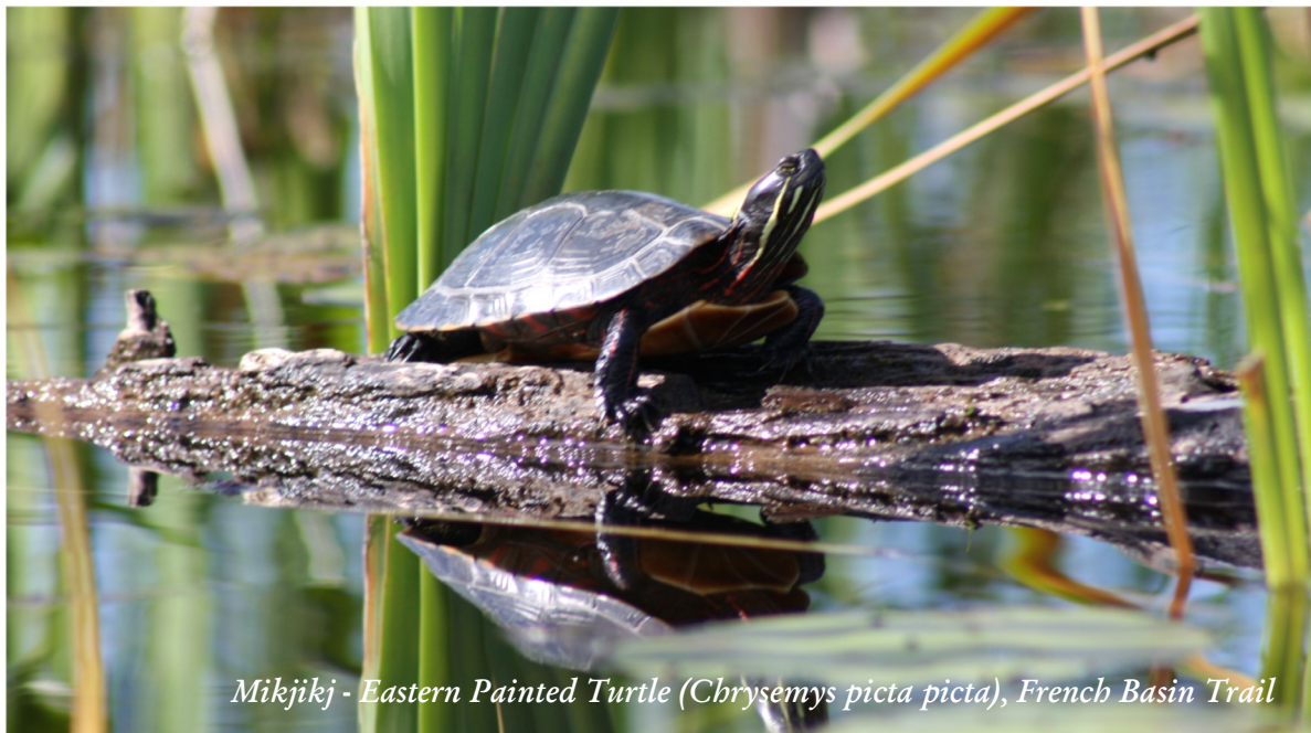
Mikjikj - Eastern Painted Turtle (Chrysemys picta picta), French Basin Trail

MONTHLY ANNOUNCEMENTS FOR RESIDENTS AND VISITORS OF ANNAPOLIS ROYAL AND AREA ANNAPOLISROYAL.COM