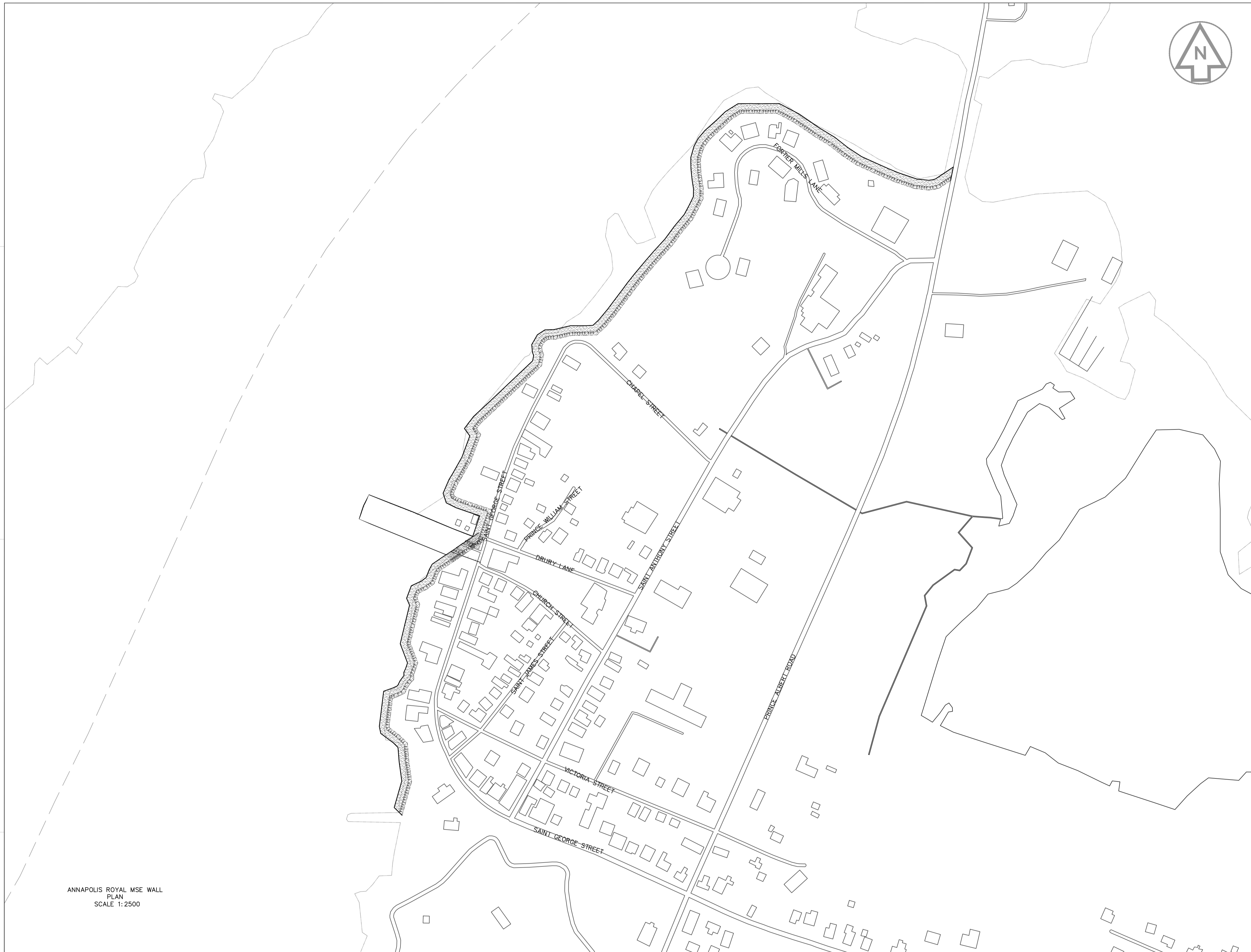
ANNAPOLIS ROYAL MSE WALL PLAN SCALE 1:2500