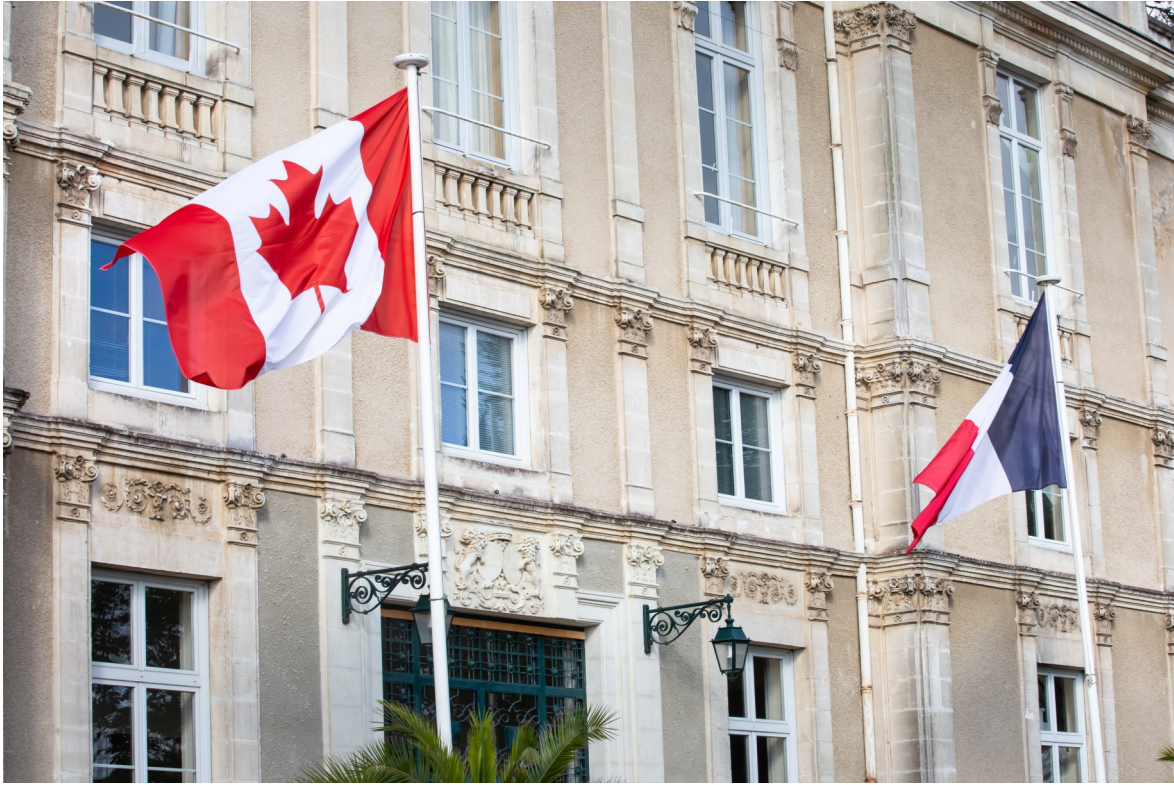
Royan, France - Flag raising

MONTHLY ANNOUNCEMENTS FOR RESIDENTS AND VISITORS OF ANNAPOLIS ROYAL AND AREA ANNAPOLISROYAL.COM