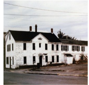
Sinclair Inn before restoration c1980

This is the first of what we hope will become a regular column in the Town Crier highlighting the extraordinary heritage of Annapolis Royal and what is being done to preserve and promote it. Your feedback and questions are encouraged. Please contact . kknox@annapolisroyal.com or 902-526-2429