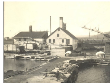
Whitman’s Company Pier, just north of the corner of Chapel Street and St George Street.

MapAnnapolis can also be found on Facebook .